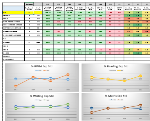
July - Early Results Dashboard