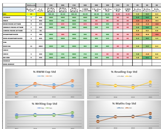
September/October – Provisional Results Dashboard